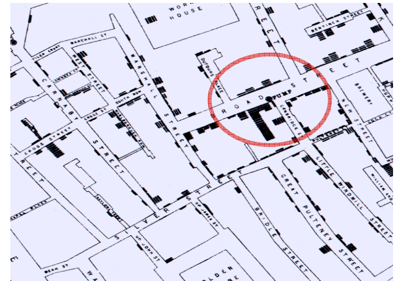
Figure 1. Early Map Depicting the Source of Cholera

T he practice of using concrete data and evidence to support medical decisions (also known as evidence-based medicine or EBM) has existed for centuries. John Snow, considered to be the father of modern epidemiology, used maps with early forms of bar graphs in 1854 to discover the source of cholera and proved that it was transmitted through water supply (Tufté, 1997).